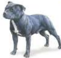
Staffordshire Bull Terrier

As of April 12, 2001, the importation of four dog breeds – American Pit Bull Terrier, American Staffordshire Terrier, Bull Terrier, Staffordshire Bull Terrier – and crosses of these breeds are prohibited in Germany. U.S. personnel who own one of the above breeds cannot bring their pets with them if they PCS to Germany. This ban applies to all US personnel PCSing to Germany. England, Belgium, the Netherlands, and Turkey also have restrictions on various breeds. Personnel who try to bring one of the banned breeds into the country can be fined or imprisoned. The prohibited dog will be confiscated and may be euthanized.