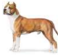
American Staffordshire Terrier